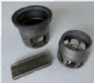
Wear monitoring with WA CAM Technology