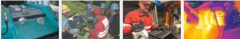
High added-value W Abrasives solutions customized for your blasting process