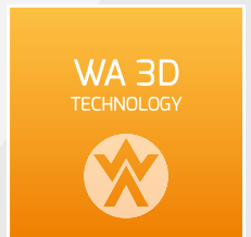
Cleanlines assessment with WA CLEAN Technology and roughness evaluation with WA 3D Technology of an aluminium carter after blasting with STELUX CN