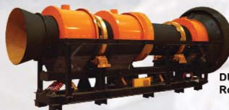
DUCTA-CLEAN® Rotary Media Drum