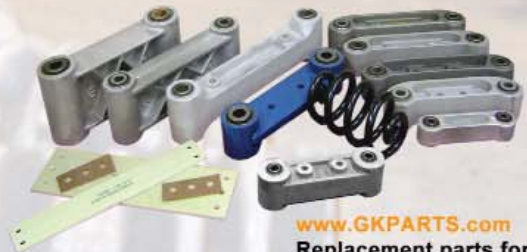
www.GKPARTS.com Replacement parts for most brands of vibratory and rotary equipment.