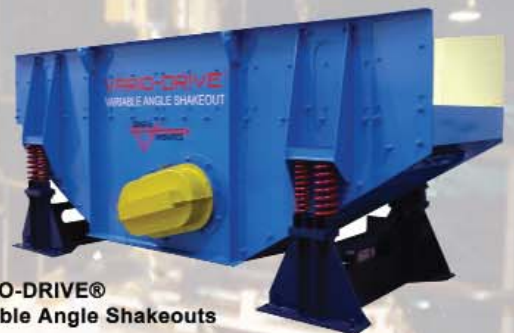
VARIO-DRIVE® Variable Angle Shakeouts