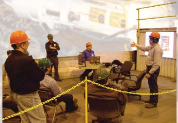
FREE Vibratory 101 training Classes