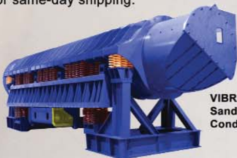
VIBRA-DRUM® Sand / Casting Conditioning Drum