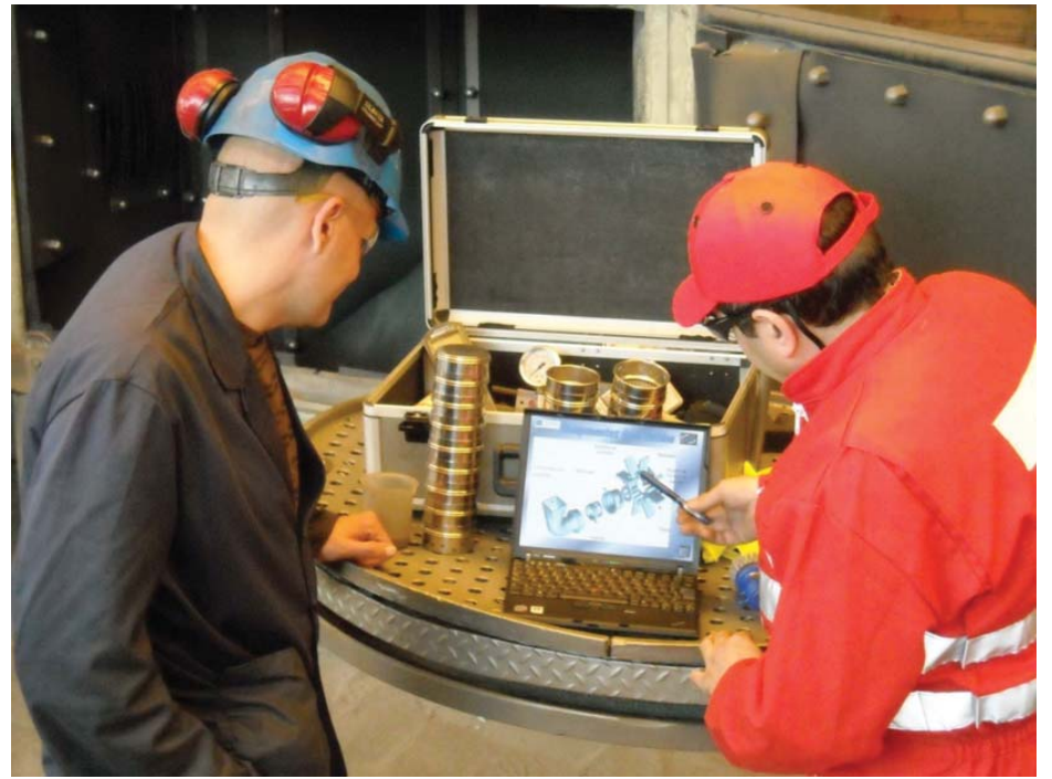
Technical assistance: WALUE (WA Leading Unit for Expertise

the marine industry around the world and is documented to perform well above expected levels in terms of blast efficiency, surface roughness and paint consumption.