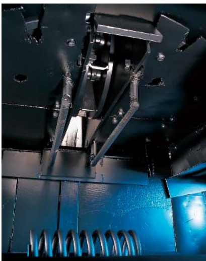
A spring shotpeening with the HRS media

(!) T. P.: UFS are very fine high-carbon steel shots (size range: 50-150 \mu\text{m} ) dedicated to both precise shot peening and double peening operations. Due to their specific production process, they combine: