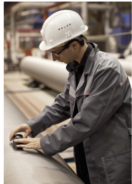
WA CLEAN device in use

(!) J.S.: Surfium has been developed in partnership with some of the biggest actors of the pipe coating industry. Compared to standard grit GL (the most common product in this application), it shows 10% less consumption for the same efficiency, and reduces the dust level on blasted parts. Thanks to its specific production process, Surfium has very narrow hardness range, which guarantees the consistency of blasted part profiles all along its usage. Three