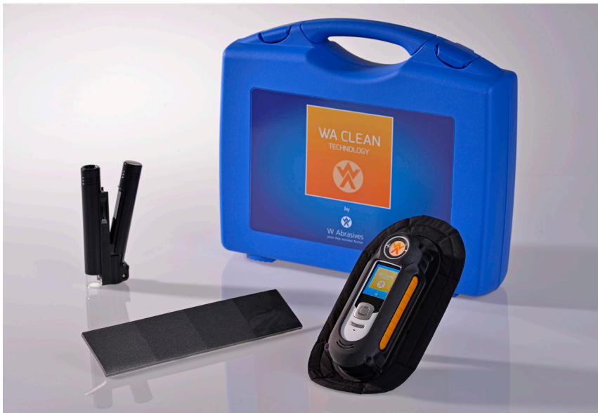
WA CLEAN kit

such as the surrounding light, the orientation of the blasted surface, the dust level... and so on.